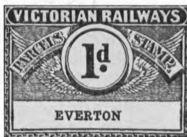
1d stamp, Die 2, as issued.

The method of cancelling the stamps was given a great deal of attention by the committee. Type of cancellation, colour of cancelling ink, and place of cancellation were discussed. The recommendation included the cancellation of stamps at both forwarding and receiving stations, and the use of black ink for cancelling.