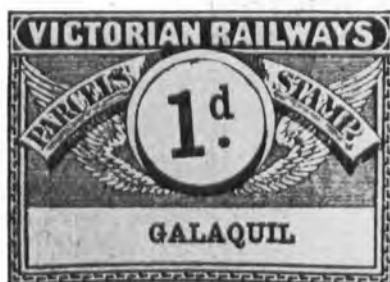
1d stamp, Die 1, as issued.

The committee, in its report of 7 August 1915, recommended elimination of the 1½d value and the addition of 4d, 7d, 1/6 and 3/- stamps.