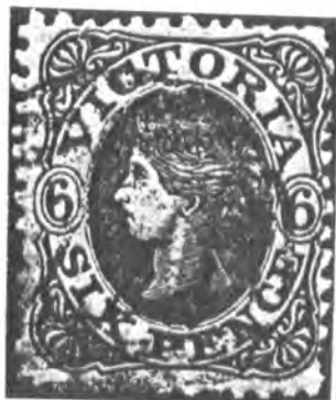
Position B8I (top) ("bearded Queen", from the London Philatelist , 1931), and B14 (bottom).