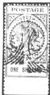
1/- perf. 12 imperforate at base.