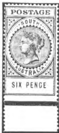
6d perf. 12 imperforate at base No. (iii) in the listing.