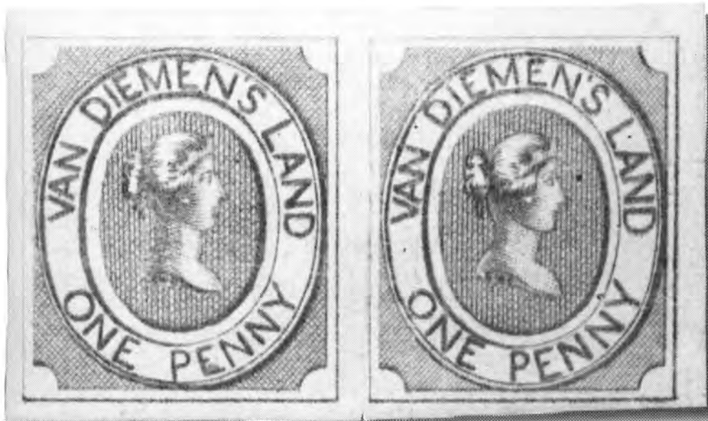
Lot 53 Tasmania 1853. 1d Pale Milky Blue, an exceptional pair, beautifully fresh with part original gum. Ex. (Burrus).