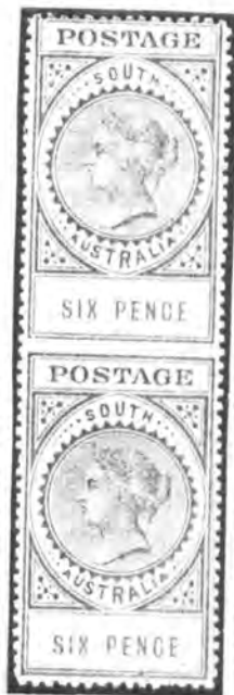
6d perf. 12½ vertical pair imperforate between. No. (iii) in the listing.