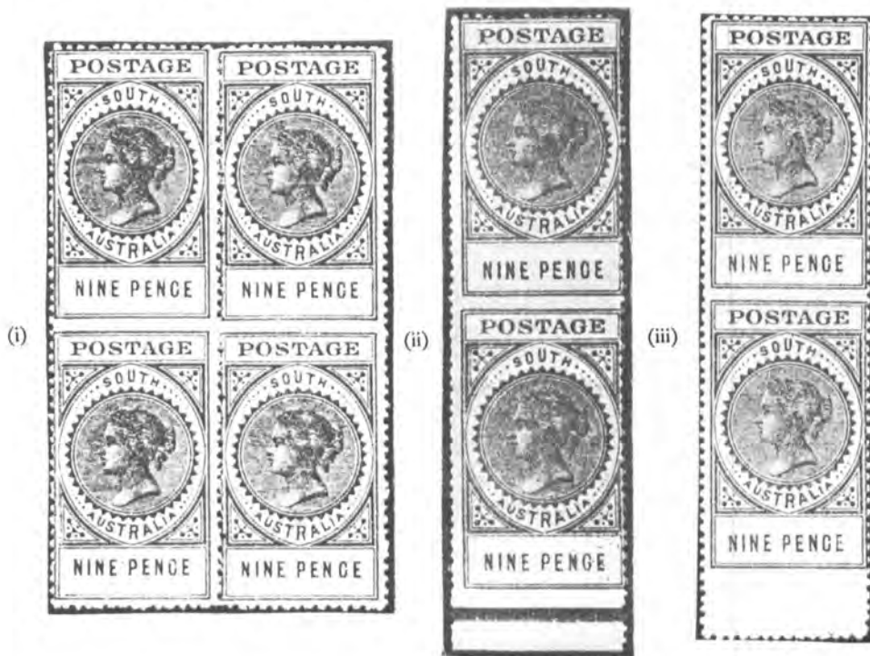
The three versions of the 9d perf. 12 imperforate between. (i) from Rows 5 and 6, with rough perfs., No. (i) in the listing; (ii) from base of sheet, No. (ii) in the listing; (iii) including interpane gutter.