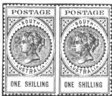
1/- perf. 12 horizontal pair imperforate between. No. (iii) in the listing.

(iv) mint horizontal pair. From the Dale-Lichtenstein collection, Harmers of New York, Sale 2854, Lot 164.