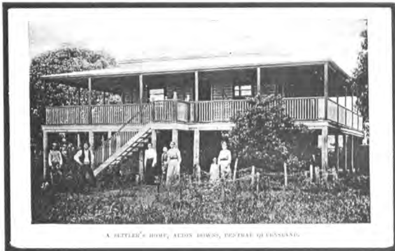
Fig. 6. A typical black and white scene on a Type F1 postcard.

exhibition printed thereon as described have been designated the "F" group, the "F" being derived from "Franco". The basic form as shown (Fig. 3) is here termed F1. Some differences later came about in respect of the address face presentation, the basis for classification. Thus, when publicity matter was added under the "Correspondence" sub-heading, this variation became F1a (Fig. 4). Later on, as a further addition, was the inclusion of the printer's imprint, reading vertically, as can be seen at Fig. 5. The latter cards gained the designation of F2.