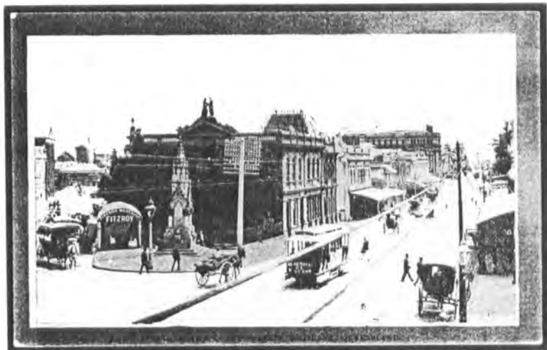
Fig. 7. A typical multicoloured scene on a Type F1a postcard.

The level of multicoloured scenes on cards of the F1a group seems to average about 86% while most of the balance comprised cards with scenes in black and white, very few being in single colours. The card illustrated at Fig. 7 is representative of a typical multicoloured f1a street scene. Within the overall F series the F1a cards were the most numerous, as can be noticed from the descriptive list in the Appendix.