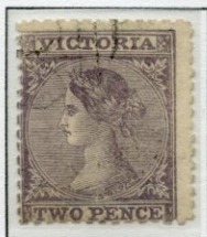
2d Dull Violet Perforation 13