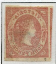
4d Dull Rose Error – Offset