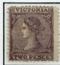
2d Violet Perforation 12

This scarce error occurred when the stamp was printed on a miss-placed sheet, outside the line of the watermark.