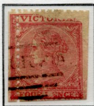
4d Deep Rose Perforation 12 Error – Printed Double (E)

Although there are no contemporary reports regarding this error, it was known to collectors given the recordings of the 1d and 2d values.