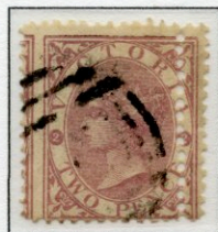
2d Dull Lilac Error – Double Perforation