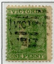
1d Deep Yellow Green