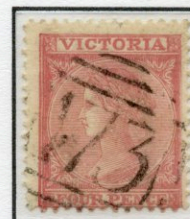
4d Rose Red Error – Watermark Sideways Facing Left (E)

This error was first reported in the “Australian States Study Circle Newsletter” in August 1980.