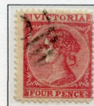
4d Dull Rose

This error was first reported in “Philately from Australia” in March 1952.