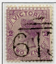
2d Violet Error – Double Perforation

This error was first reported in the “Australian Stamp Monthly” in June 1938 and listed by Stanley Gibbons in 2005. This is the only multiple recorded.