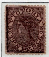
10d Dull purple/ Pink Error – Watermark Inverted

This error was first reported in “Philately from Australia” in March 1952 and listed in the Stanley Gibbons catalogue in 2010. It is the only recorded example.