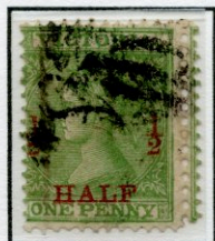
\frac{1}{2} d on 1d Green Error – Mixed Perforation 13 and 12(E)

Victoria August 1873 Watermark V/Crown Perforation 13