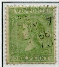
1d Pale Yellow Green Watermark "SIX PENCE" Error – Watermark Sideways Facing Right (E)

Victoria September 1867 Watermark Words Perforation 13