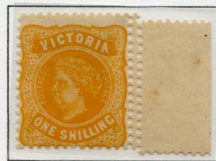
1/- Yellow Orange Error – Double Perforation

This error was first reported in "Philately from Australia" in March 1952 and listed by Stanley Gibbons in 2005. It is quite scarce, with most used examples known perforated "OS". One mint copy is recorded.