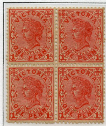
1d Pale Rose Red (Die III) Error – Watermark Sideways Facing Left

This error was first reported in "Philately from Australia" in March 1952 and listed by Stanley Gibbons in 2000.