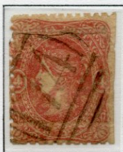
4d Rose red Error – Watermark Reversed