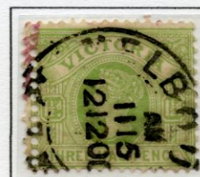
1 1/2d Apple Green Error – Double Perforation

This error was first reported in the “Australian Stamp Monthly” in June 1938 and listed by Stanley Gibbons in 2005. This is the only multiple recorded.