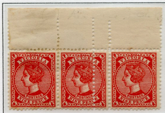
9d Rose Carmine

Perforation 11\frac{1}{2} \times 12\frac{1}{4}