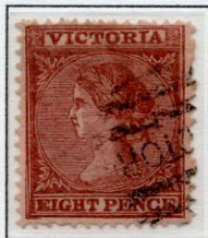
8d Red Brown/Pink Error – Watermark Reversed