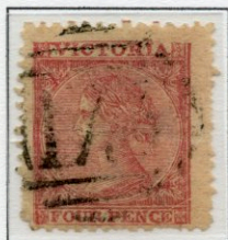
4d Rose Red Error – Watermark Reversed

This error was first reported in the “Australian States Study Circle Newsletter” in August 1980.