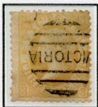
3d Yellow Orange

Error – Watermark Sideways Facing Right (E)