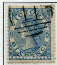
6d Blue Error – Double Perforations

This error was first reported in "Philately from Australia" in March 1952 and listed in the Stanley Gibbons catalogue in 2010. Two examples are recorded.