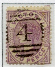
2d Deep Lilac Mauve Error – Double Perforation