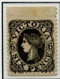
6d Black Error – Imperforate Between Stamp and Margin at Top

There is no record of this error in any contemporary literature and it is the only recorded example.