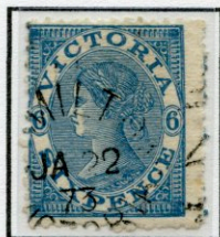
6d Blue Error – Watermark Sideways Facing Right (E)

This error was first reported in "Philately from Australia" in March 1952 and listed in the Stanley Gibbons catalogue in 2010. Two examples are recorded.