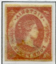
4d Dull Rose Error – Offset