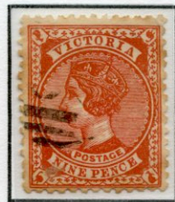
9d Dull Brown Red Error – Watermark Sideways Facing Right

There are no early reports in philatelic literature regarding this error and it was listed in the Brusden White catalogue in 2004.