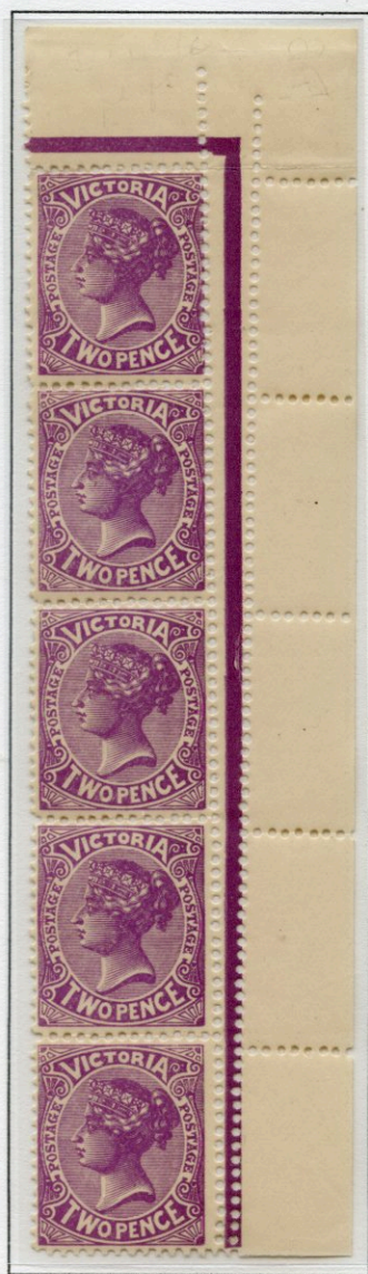
2d Reddish Violet Error – Double Perforations

Victoria July 1905 Watermark Crown/A Perforation 12 x 12½