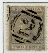
2d Dull lilac