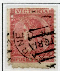
4d Dull Rose

This error was first reported in “Philately from Australia” in March 1952.