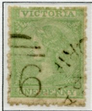
1d Yellow green

This error was first reported in “Philately from Australia” in March 1952, although no distinction was made between the shades and the direction of the watermark. These errors were listed in the Stanley Gibbons catalogue in 2010. Less than half a dozen examples of each are estimated to exist.