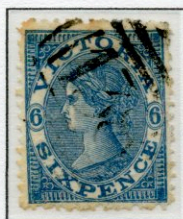
6d Dull Blue Error – Watermark "SIX PENCE" Reversed

September 1867 Watermark Words Perforation 13