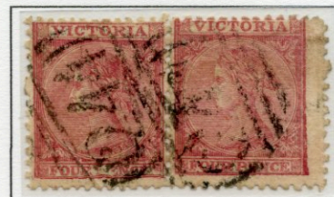
4d Dull Rose Red

This error was first reported in the “Australian States Study Circle Newsletter” in August 1980.