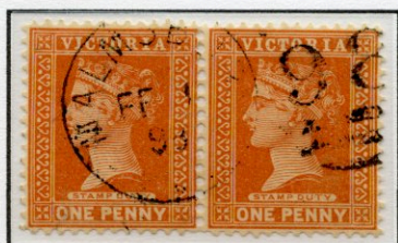
1d Brownish Orange Error – Watermark Sideways Facing Right