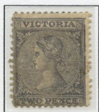
2d Grey Watermark Single Lined “4” Error – Double Strike on “TWO PENCE”

This error was first reported in the “Australian States Study Circle Newsletter” in August 1980.