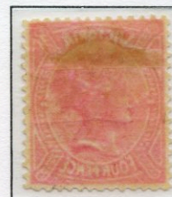
4d Rose Carmine Error – Offset