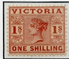
1/- Brownish Red

This error was first reported in “Philately from Australia” in March 1952 and listed by Stanley Gibbons in 2005. It is much rarer than the 1899 printing and only three examples are recorded.