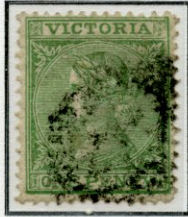
1d Bluish Green

Error – Watermark Sideways Facing Left (E)