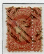
4d Rose red Error – Double Perforation