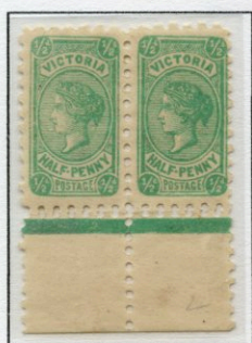
\frac{1}{2} d Blue Green Error – Double Perforation

There are no early reports in philatelic literature regarding this error and it was listed in the Brusden White catalogue in 2004.