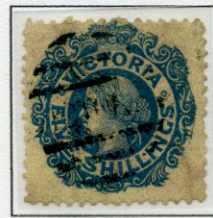
5/- Blue / Yellow