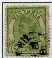
1d Yellow Green Error – Double Perforation

October 1873 Watermark V/Crown Perforation 13