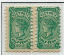
½d Blue green (Die I) Error – Double Perforations