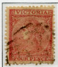
4d Deep rose Perforation 13 Error – Watermark Inverted and Reversed

This error was first reported in the "Philatelic Journal of Great Britain" in October 1929.