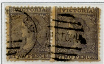
2d Grey Lilac