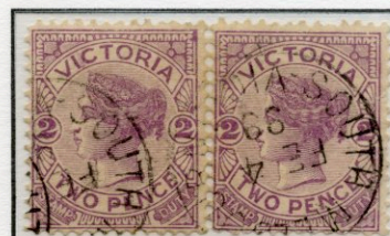
2d Violet Error – Watermark Sideways Facing Left

This error was first reported in “Ewans Weekly Stamp News” in January 1910 and listed by Stanley Gibbons in 2000. It is much scarcer than the 1899 printing. This is the only multiple recorded.