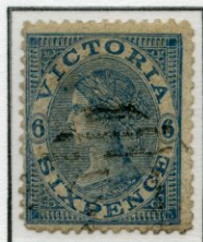
6d Dull Blue