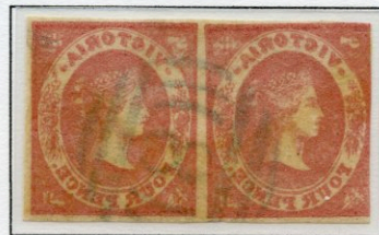
4d Dull Rose Error – Offset