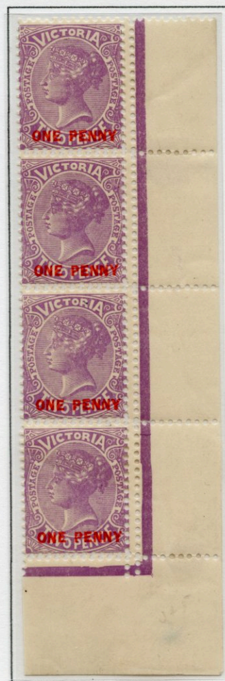
2d Reddish Violet

Perforation 11\frac{1}{2} \times 12\frac{1}{4}