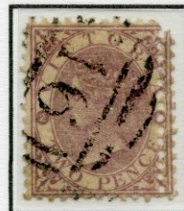
2d Dull Lilac Error – Mixed Perforation 12 and 13(E)

This stamp is perforated 12 all round with an additional vertical perforation 13 at right thereby creating the error. This stamp was discovered in 2015 and will be listed in the 2017 edition of the Stanley Gibbons catalogue. It is the only recorded example.