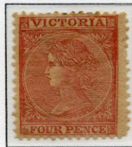
4d Deep rose Perforation 13 Error – Watermark Reversed

This error was first reported in the "Philatelic Journal of Great Britain" in October 1929.