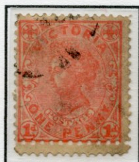
1d Dull Red (Die II) Mixed Perforations 12½ and 11 (E)

This error was first reported in "Philately from Australia" in March 1952 and listed by Stanley Gibbons in 2000. Mint blocks are scarce.