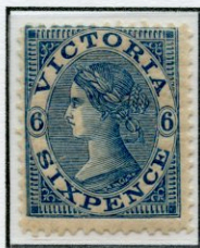
6d Blue Error – Watermark Inverted

This error was first reported in "Philately from Australia" in March 1952.