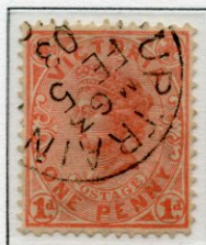
1d Dull Red (Die II) Error – Watermark Sideways Facing Right

This error was listed by Stanley Gibbons in 1999.