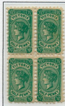
½d Blue green (Die I) Error – Watermark Upright

This error was listed by Stanley Gibbons in 1999.