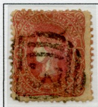
4d Rose red Error – Watermark Inverted