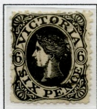
6d Grey Black Error – Watermark Inverted

There is no record of this error in any contemporary literature and it is the only recorded example.