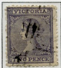
2d Dull violet