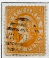
3d Bright Orange

This error was first reported in the “V/Crown Watermark” monograph by J.R.W. Purves in 1958 and was listed in the Stanley Gibbons catalogue in 2010. The Yellow Orange shade is particularly rare, being the only example recorded. About half a dozen examples of the Dull Orange shade are estimated to exist.