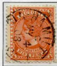
9d Pale Rose Error – Double Perforation

This error was first listed by Brusden White in 2004.