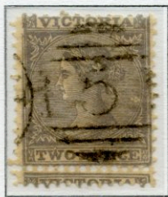
2d Grey Perforation 13 Error – Double Perforation