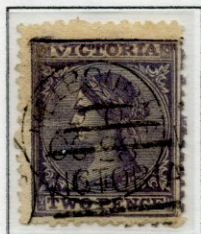
2d Violet Perforation 12 Error – Watermark Reversed