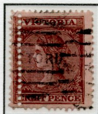
8d Red Brown/Pink Error – Watermark Sideways Facing Left And Double Perforations

This error was first reported in the "Australian Philatelic Record" in March 1929. It was mentioned as a note in the Stanley Gibbons catalogue in 1958 before being listed in 2007. About a dozen examples are estimated to exist.