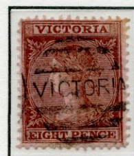
8d Red Brown/Pink Error – Watermark Sideways Facing Right

This error was first reported in the "Australian Philatelic Record" in March 1929. It was mentioned as a note in the Stanley Gibbons catalogue in 1958 before being listed in 2007. About a dozen examples are estimated to exist.