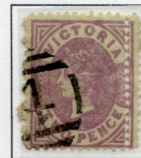
2d Deep Lilac Mauve/Green Error – Double Perforation