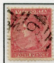
4d Dull Rose