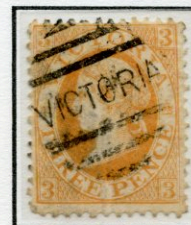
3d Dull Orange

Error – Watermark Sideways Facing Right (E)