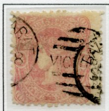
4d Rose pink Watermark Single Line 4 Error – Watermark Inverted