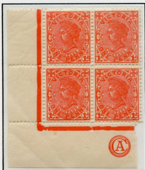
1d Rose Carmine

Perforation 11\frac{1}{2} \times 12\frac{1}{4}