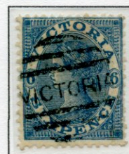
6d Dull Blue Error – Watermark "SIX PENCE" Inverted

This error was first reported in the Australian Stamp Monthly in September 1931.