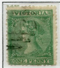
1d Green Perforation 13 Error – Watermark Inverted

This error was first reported in the “Philatelic Journal of Great Britain” in January 1930.