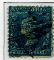
2/- Greenish blue/Green Error – Watermark Reversed

This error was first reported in the “Australian States Study Circle Newsletter” in August 1980.