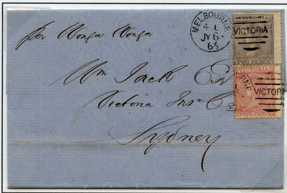
2d Dull Violet Perforation 12

This constant error occurred through faulty electrotypes. Examples in unused condition are rare.