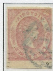
4d Reddish Pink Error – Offset