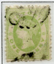
1d Yellow Green Error – No Watermark