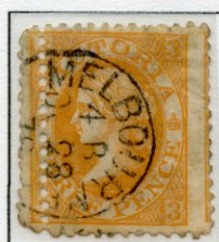
3d Bright Orange