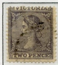
2d Dull violet