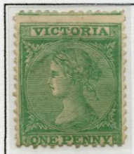
1d Green Perforation 13 Error – No Watermark

This error was first reported in the “Philatelic Journal of Great Britain” in January 1930.