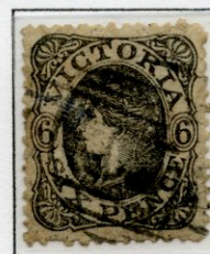
6d Black Error – Watermark Reversed

This error was first reported in the Australian States Study Group Newsletter in April 1983.