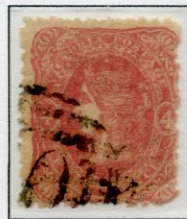
4d Rose pink Error – Watermark Inverted and Reversed