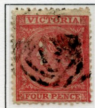
4d Deep rose Perforation 13 Error – No Watermark

This error was first reported in the "Philatelic Journal of Great Britain" in October 1929.