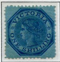
1/- Light Blue/ Blue