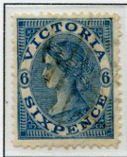
6d Blue Error – Watermark Reversed

This error was first reported in "Philately from Australia" in March 1952.