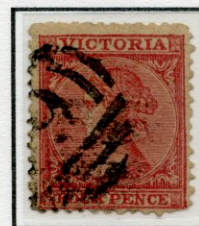
4d Pink Perforation 12 Error – Watermark 8 (E)

This is one of the great watermark errors of Victoria and was first reported in "Vindins Philatelic Monthly" in July 1894 (this example is now lost) and it was listed by Stanley Gibbons in 1899. Two examples are recorded, this one being the most recent find in 2008.