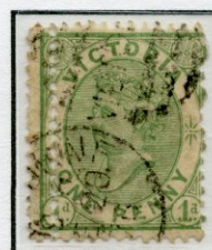
1d Yellow Green Error – Mixed Perforation 12 and 13

This stamp is perforated 12 x 13 all round with an additional vertical perforation 12 at left thereby creating the error. Two examples are recorded.