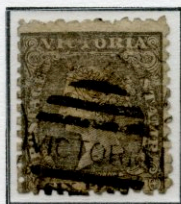
6d Black Watermark “SIX PENCE” Error – Watermark Inverted

Although not mentioned in the Purves monograph on the Victorian Woodblocks, this particular stamp was from the Purves collection, who recorded only two examples of this error.