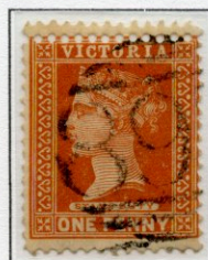
1d Brownish Orange Error – Double Perforation