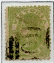
1d Pale Green Watermark "ONE PENNY" Error – Watermark Inverted