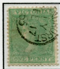
1d Bluish Green Perforation 13 Error – Printed Double (E)

This is the most dramatic double strike error on the 1d value. It is very scarce in unused condition.