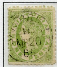
1d Yellow Green Watermark Double Lined "1" Error – Watermark Inverted