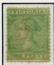
1d Pale Green Perforation 13 Error – Double Strike on “ONE”

This is the most dramatic double strike error on the 1d value. It is very scarce in unused condition.