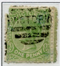
1d Yellowish Green Error – Double Perforation