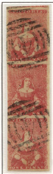
[12-18-24] Sandhurst 4