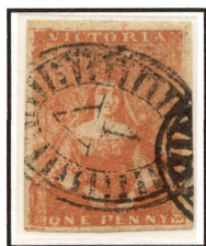
[1] Melbourne 1 Bottom left corner Ex Caspary, Fraser