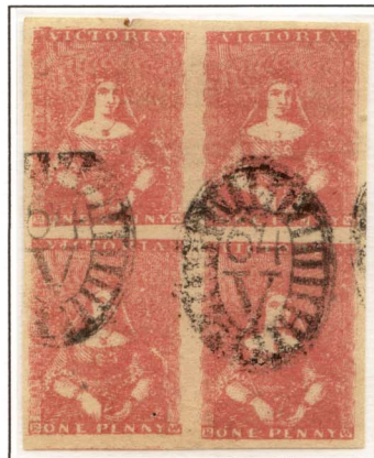
[1-2/7-8] Heathcote 64