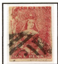
[6] Retouched left frame