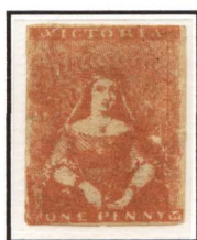
[1] Bottom left corner The only unused example recorded of this retouch

There are five retouches found from Stone 3. It is believed that they all come from one part of the sheet associated with one of the transfer group "cuts". These retouches are rare, with less than six examples of each recorded.