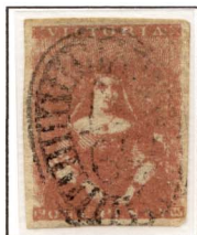
[8] Prahran 59 Ex Slade Slade