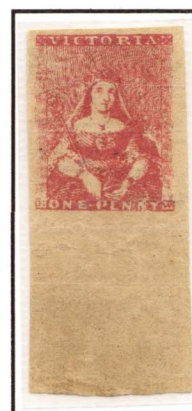
[7] The only recorded unused abnormal Ex Caspary