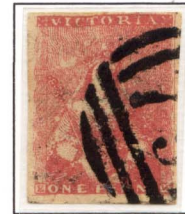
[6] Top Label "TOR"