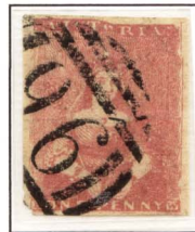
[6] Top label "CT"