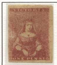
[9] Secondary flaw in left border Ex Perry