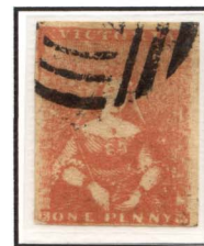
[21] Top left corner