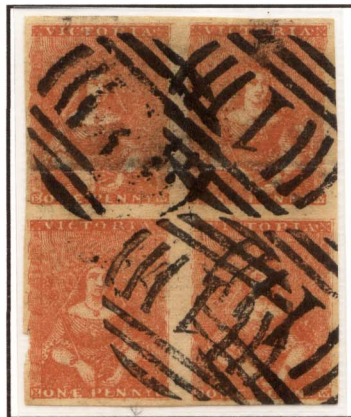
[20-21/2-3] Melbourne 1 Showing the intersection between two transfer groups Four blocks recorded