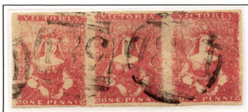
[6-5-6] Lexton 58 Ex Pack, Wawn