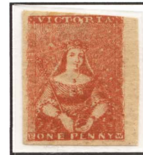
[12] Ex Perry