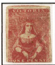
[1] Retouched left frame The only unused example recorded

There are at least eight retouches on Stones 4 and 5 ( these two stones cannot be differentiated) and are all associated with one of the “cuts” down the right side of the pane. They are so rare that the repairs may have been effected some time after the start of printing, but the pre-retouch states of the units have not been identified.