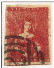
[9] Top label "TORIA"