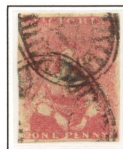
[16] Top label "VIC"