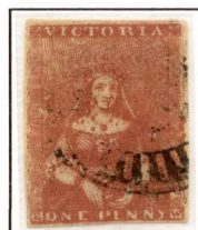
[8] Coloured spots on the Queens face