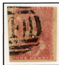
[6] Retouched left frame