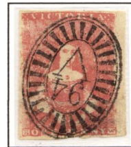
[15] Convex top label