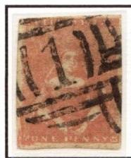
[13] Melbourne 1 Bottom left corner