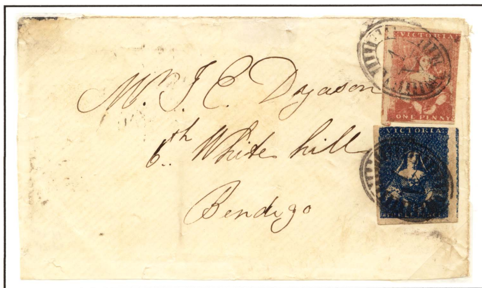
1d Dull Rose Red [19] showing retouched bottom left corner and Stone D 3d Indigo [21] cancelled by Barred Oval 1 on cover front pre-paying the 4d inland letter rate from Melbourne to Bendigo.

The only recorded example of this retouch on cover