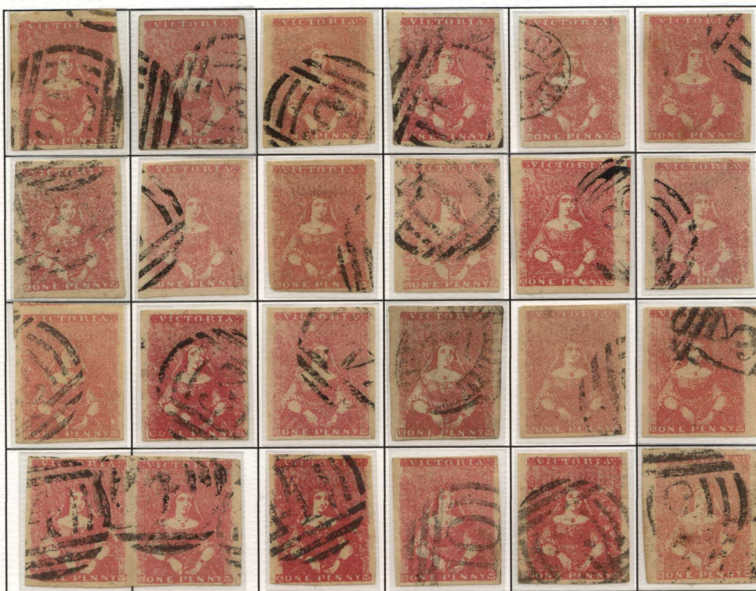
Reconstruction of the intermediate stone of 24 subjects used to create a printing stone of 200 impressions (ten rows of twenty).