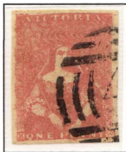
[1] Top label "VICT"