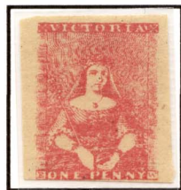
[10] The only unused "White Line" variety recorded Ex Perry

This secondary variety consists of prominent white lines and scratches crossing the stamps. These varieties were caused by scratches present on the printing stone prior to the transfers being laid down.