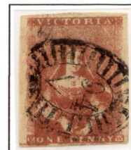
[22] Avoca 94