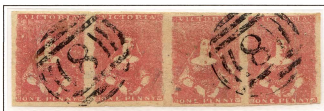
[23-24-19-20] Portland 8