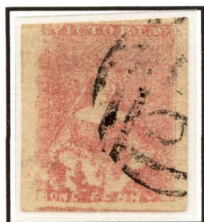
[11] Retouched ONE PENNY Four examples recorded Ex Purves, Perry