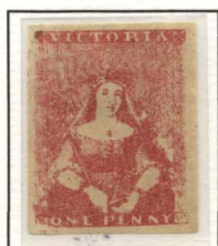
[19] Ex Ferrari