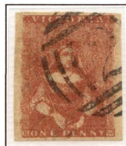
[4] Geelong 2