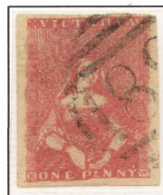
[10] Bottom label "PEN"