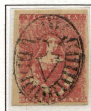
[8] Avoca 94