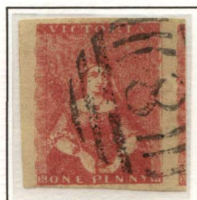
[4] Portland 8