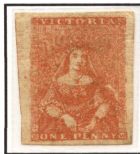
[7] Eight unused examples recorded