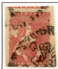
[5] White flaw to the left of the Queens head