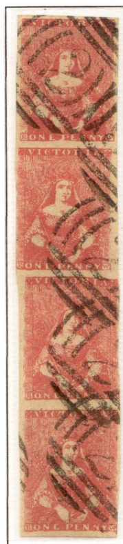
[16/22/4/10] Geelong 2 Ex Pack, Perry