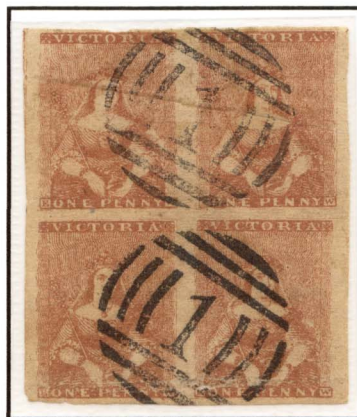
[15-16/20-21] The only recorded used block Ex AP, Perry