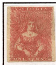
[18] White flaw at the base of "E" of PENNY