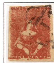
[22] Coloured flaws below the value tablet