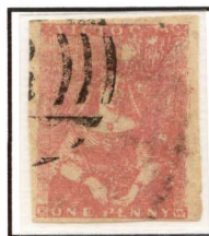
[21] Retouched top right Four examples recorded Ex Perry