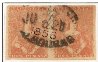
[23-24] Newspaper/Melbourne Ex Pack