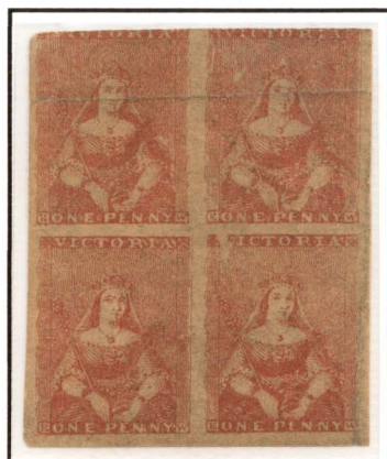
[5-6/11-12] The only recorded unused multiple