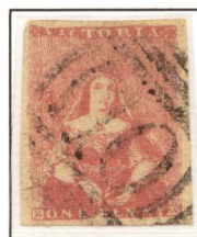
[16] Top label "VICTOR"