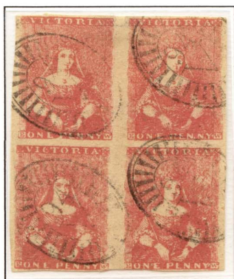
[16-17/22-23] Ovoca 94 Ex Pack, Harris