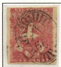
[3] Coloraine 99