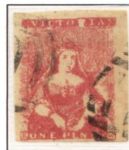
[14] Top label "VICTOR"