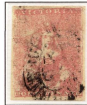
[6] Top label "TO"