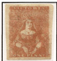
[5] Two unused singles recorded