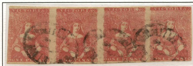
[9-10-11-12] The Grange 19