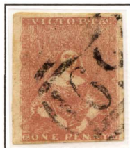
[11] Prahran 69