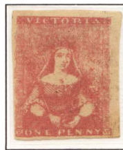
[22] Top label "RIA" Ex Perry

The squeezed transfer varieties occur only on Stone 4 and 5 printings and signify a different technique used in the manufacture of these stones. These stones were probably prepared by making up the 400 units, then laying them down in one piece on the printing stone, whereas the other stones were laid down transfer by transfer. The differential rates of contraction of such a large unit caused the squeezed transfer varieties, which show up as distortions of the design. At least 60 prominent squeezed transfers, and many less conspicuous ones occur.