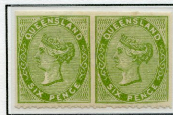
6d Yellow Green Error - Imperforate Vertically (E)

This error was first reported in the "London Philatelist" in December 1902. With the purchase by Stanley Gibbons of the Hausburg collection in 1916 it was subsequently listed in their British Empire catalogue in 1917. This is the only recorded example.