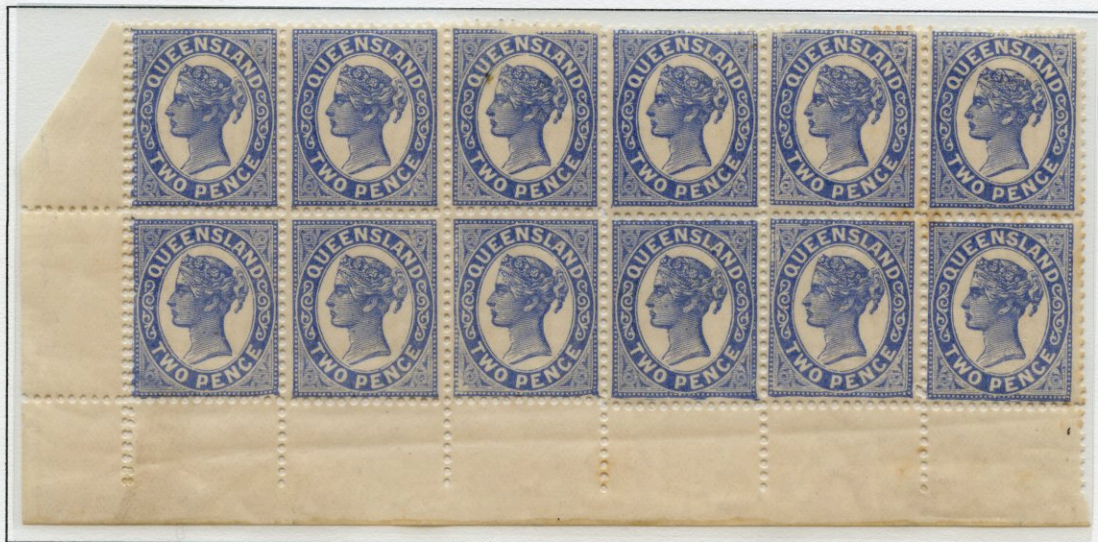
2d Blue Error - Double perforation

This error was first recorded in the Australian States Study Newsletter in January 1980.