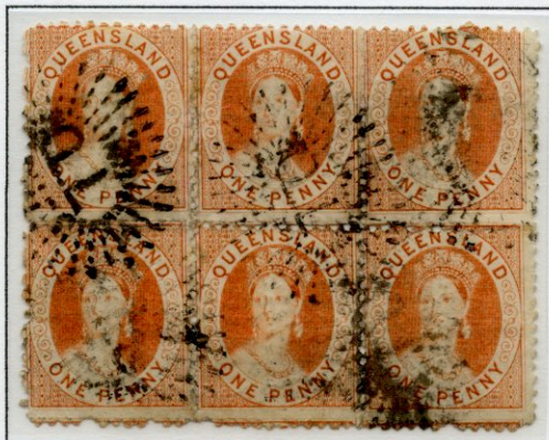
1d Orange Vermillion Error - Watermark Reversed