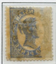
2d Blue Error - Offset