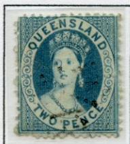
2d Bright Blue

There are no contemporary reports regarding the discovery of this error. The only recorded examples are this unused stamp and the cover on the previous page.