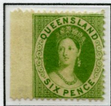
6d Yellow Green Error - Imperforate Between Stamp and Margin at Left

There are no contemporary reports regarding the discovery of this error. The only recorded examples are this unused stamp and the cover on the previous page.