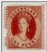
1d Carmine Rose Error - Double Perforation

Queensland September 186 Watermark Small Star Rough Perforation 14-16