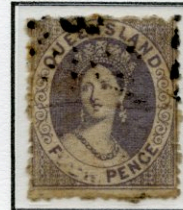
4d Lilac Error - "FOUR" Missing (E)

This error was first reported in the London Philatelist in July 1895 and listed in the Stanley Gibbons catalogue in 2005. These are the only examples recorded of the Lilac shade showing the value completely missing.