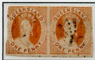
1d Orange Vermillion Error - Imperforate

December 1862 Thick Paper No watermark Rough Perforation 13