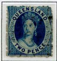
2d Blue Error - Double Perforation

Mint examples of double perforations in the Queensland Chalons are very scarce.