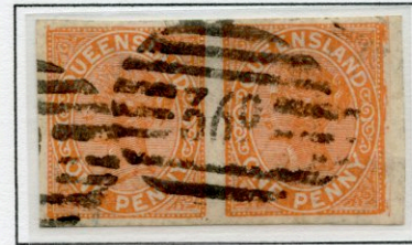
1d Vermillion Red Error - Imperforate (E)

This error was first reported in Vindin's Philatelic Monthly in September 1892 and was noted in the Stanley Gibbons catalogue in 1912 before being listed in 1917. Used pairs are particularly scarce.