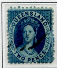
2d Deep Blue