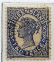
2d Blue Error - Watermark Reversed