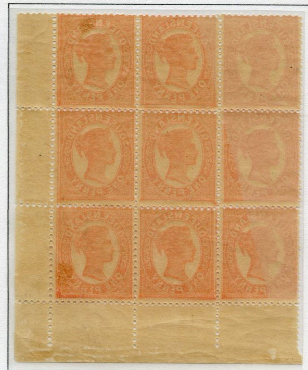
1d Orange Red Error - Offset

This error was first recorded in the Australian States Study Newsletter in January 1980.