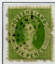
6d Yellow Green