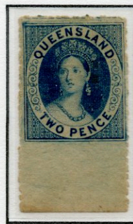
2d Blue Error - Imperforate Between Stamp and Margin at Base

This error was first reported on the 23rd of June 1948 with the auction of this stamp by Robson Lowe in London. It is the only example recorded.