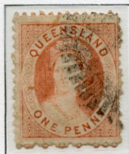
1d Pale Orange Vermilion