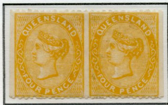
4d Orange Yellow Error - Imperforate Vertically (E)

Queensland April 1879 Watermark Crown/Q Perforation 12