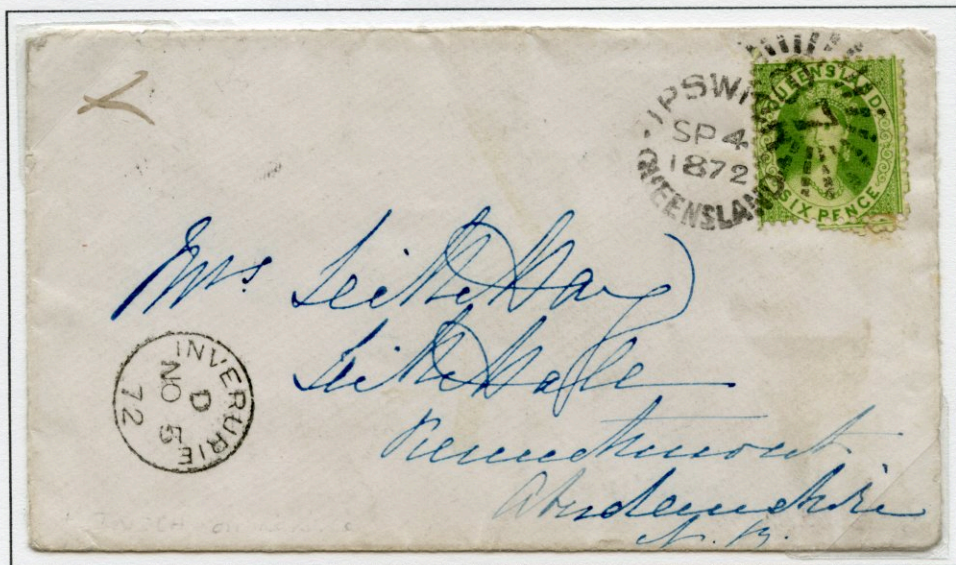
6d Yellow Green on cover from Ipswich 4.91872 to England Error - Double Perforation