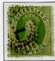
6d Yellow Green