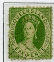
6d Yellow Green

The watermark reversed error is the most common watermark error in this issue and occurs across all values. It was first reported in the Australian States Study Group Newsletter in January 1980.