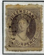
4d Reddish Lilac Error - Double Transfer

The first recording of this error was in The Philatelic Journal in March 1951 featuring the unused stamp at the left and listed by Stanley Gibbons in 2005. It is difficult to understand how this double transfer error can occur when printed by lithography. These two stamps are the only examples recorded of this rare error in private hands. An unused example is in the Royal collection.