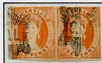
1d Orange Vermillion Error - Imperforate

This error was first recorded in the London Philatelist in April 1894 and it was listed by Stanley Gibbons in 1917. Blocks of four are the largest multiple known in private hands and three are recorded. A remarkable unused block of 60 resides in the H. L. White collection in the New South Wales State Library. The used pair is the only recorded example.