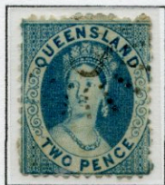
2d Pale Blue

The watermark reversed error is the most common watermark error in this issue and occurs across all values. It was first reported in the Australian States Study Group Newsletter in January 1980.