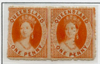
1d Orange Vermillion Error - Double Perforation

Mint examples of double perforations in the Queensland Chalons are very scarce.