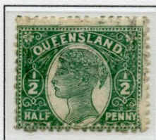
½d Green Error - Double Perforation

Queensland 11th May 1895 Watermark Crown/Q Perforation 12½, 13 comb